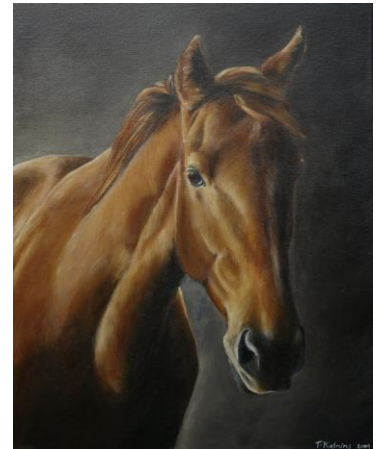
Examples of acrylic paintings on stretched canvas