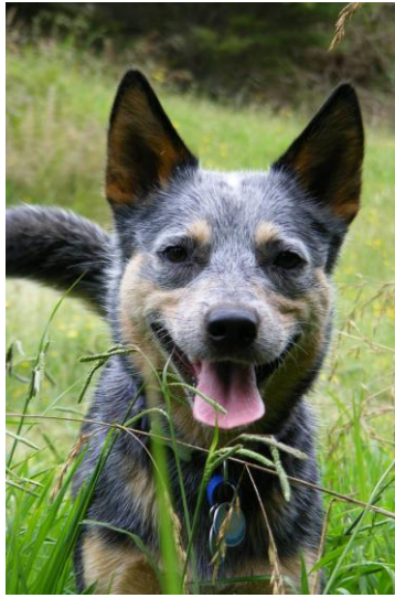
An example of a suitable photo for a portrait. Additional close-ups of face would also be needed for detail work.