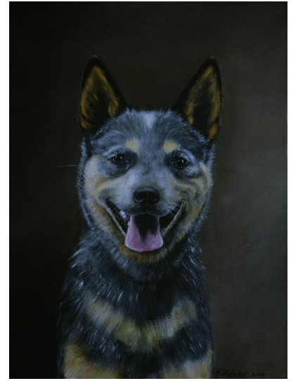
The finished painting!

If the painting is to be a memorial portrait for a pet that has recently passed away, and there are limited suitable photos available, please contact me to arrange a viewing of the photos as it may still be possible to do a painting from them.