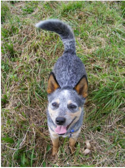
An example of an unsuitable photo for a portrait